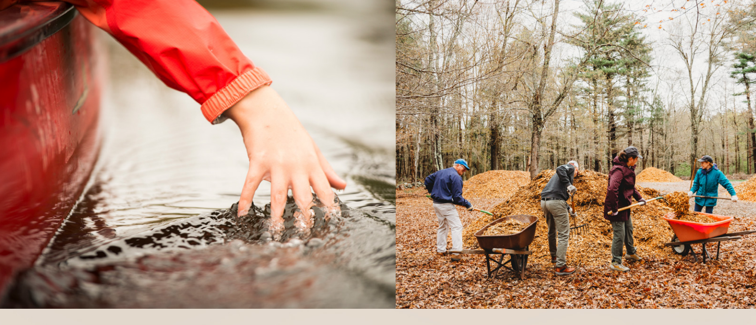
Volunteers help keep the habitats at our wildlife sanctuaries healthy.