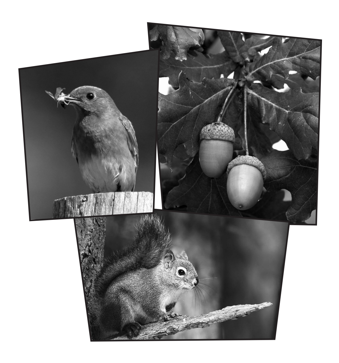
This All Persons Trail project was developed cooperatively between Mass Audubon and the Recreational Trails Program