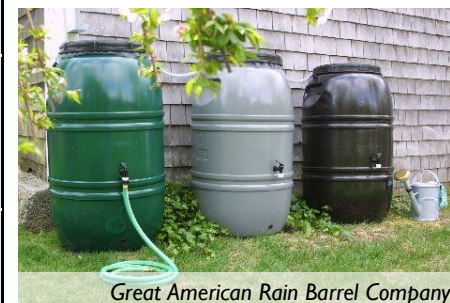
Great American Rain Barrel Company

A small, slanted green roof in Craftsbury, VT.