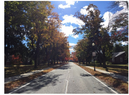
This narrow road in Devens, MA easily fits two lanes of traffic and offers room for a vegetated buffer, sidewalk, and street trees.

By reducing the amount of pavement, communities are not only reducing their impervious surface and allowing more space for stormwater infiltration, but also realizing a huge cost savings. Traditional paving costs about $6ft 2 . Reducing just a short two-mile road from 28' wide to 20' equates to a savings of over $500,000. Less pavement also means reduced maintenance costs, including plowing, salting, and sweeping.