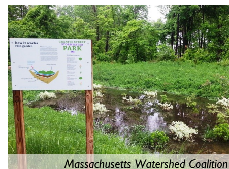
Massachusetts Watershed Coalition

These Devens, MA homes have met the required 20' wide emergency vehicle access in a unique way. They installed 12' of pavement and 8' of permeable grass pavers to the left to minimize pavement without compromising safety.