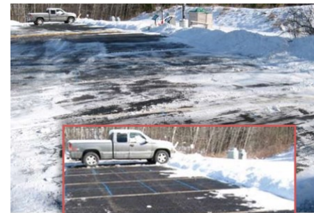
National Asphalt Pavement Association

This parking lot in Narragansett, RI shows traditional asphalt on the left, where puddles have formed, and permeable pavement on the right, where it has soaked through.