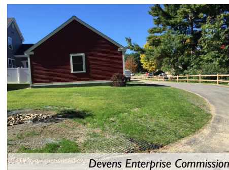
Devens Enterprise Commission

These Devens, MA homes have met the required 20' wide emergency vehicle access in a unique way. They installed 12' of pavement and 8' of permeable grass pavers to the left to minimize pavement without compromising safety.