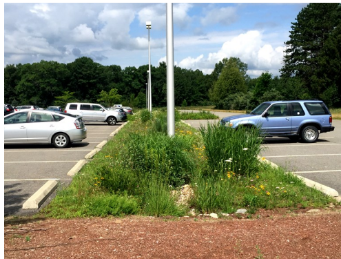
Bioretention strips filter parking lot runoff

Best Management Practices (BMPs) can be installed in both new and redevelopment. Any time land will be disturbed, find ways to minimize impervious surfaces and keep stormwater at its source. Soil and vegetation break down pollutants and infiltrate water—whether by the side of a road or from rooftops. By slowing the rate of runoff, these BMPs also reduce flooding and associated financial and health-related costs.