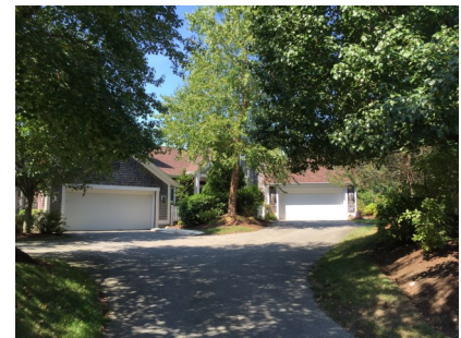
This shared driveway in the Pinehills in Plymouth, MA provides easy access to garages, plenty of parking, and less impervious surface. Retention of mature trees also offers privacy.