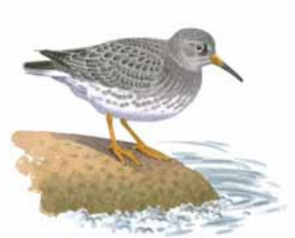
Purple Sandpiper (Calidris maritima)

Though hardly purple, these shorebirds bear a unique color combination of gray feathers and bright orange legs. They're found in flocks on barnacle-encrusted rocks along the shore where they feed on crustaceans and other invertebrates in the intertidal zone—the band between the high- and low-tide lines.