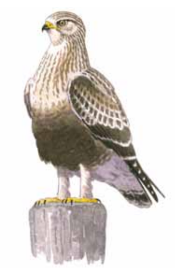
Rough-legged Hawk (Buteo lagopus)

Early settlers chose this name because the birds reminded them of tree sparrows back home, though American tree sparrows feed mainly on the ground. Look for these birds hunting for seeds in weedy places. Their rusty cap, bicolored bill (gray on top; yellow underneath), and black breast spot are distinctive.