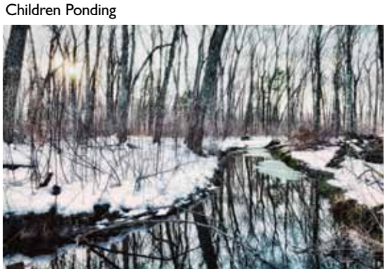
Winter at Oak Knoll Wildlife Sanctuary

bodies like Lake T are valued amenities for any wildlife sanctuary because they serve as both a haven for wildlife and a magnet for people.