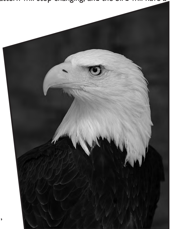
By Saffron Blaze

Human disturbance, habitat change, and unregulated hunting led to the slow disappearance of Bald Eagles from Massachusetts more than a century ago – but there is a happy end to this story! The Bald Eagle's return to the commonwealth has been a tremendous conservation success. Between 1982 and 1988, the Division of Fisheries and Wildlife introduced 41 young birds into the wilds of Quabbin Reservoir in central Massachusetts in the hope that they would return to the same area as nesting adults. This project succeeded in 1989, when a nesting pair of eagles raised two chicks, the first born in Massachusetts since 1902. Since then, Bald Eagles have spread throughout the commonwealth, with 30 successful nests counted in 2013.