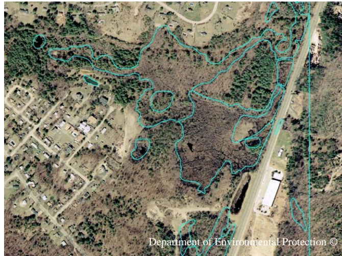
DEP aerial photo showing approximate locations of wetlands outlined in blue

individuals, oversee open space planning efforts. Open space and recreation plans focus on identifying and protecting the community's natural resources and their ecological functions, as well as providing recreational facilities to meet community needs. They describe the land- and water-based resources in the community and lay out a plan for their management. They address, therefore, development potential, land management interests, and open space protection priorities in the context of watershed management, greenways protection, wildlife habitat protection, and public open space preservation.