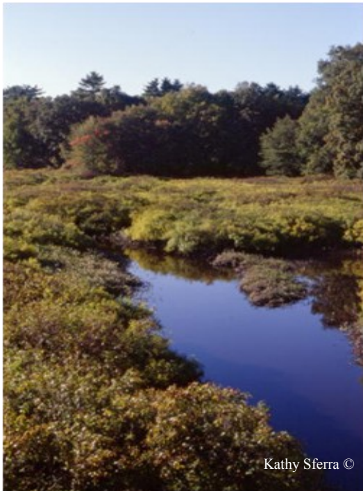
Kathy Sferra ©