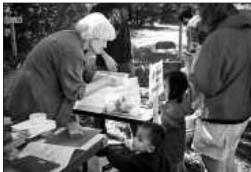
Visitors made sun prints with the Olmsted National Historic Site volunteers.

Boston, Cruz Management, Feinberg, Campbell, & Zack, PC, Forest Hills/Jamaica Plain Kiwanis, GunnDesign, Halvorson Design Partnership, Inc., Harry R. Feldman, Inc., ICON Architecture Inc., Lena New Boston/Olmsted Green, Mass Energy Consumers Alliance, Northstar Mechanical, ProPrint Boston, Seaport Graphics, and Stage One Production.