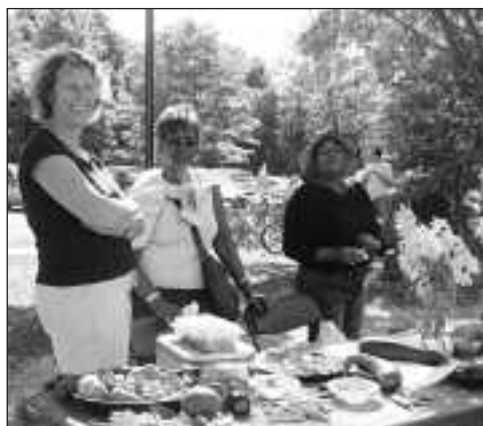
The Clark Cooper Community Gardeners display of vegetables, fruit and flowers from their gardens at the September 29th Rappin' with Raptors Event.