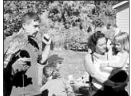
A Red-shouldered Hawk from the Blue Hills Trailside Museum fascinates the crowd.