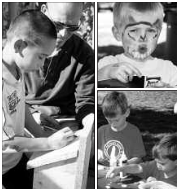
Bird house building, face painting and arts & crafts made for a fun-filled day.