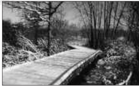
Take a walk on the boardwalk of the Rabbit Trail in the winter snow to see many different birds and animals.