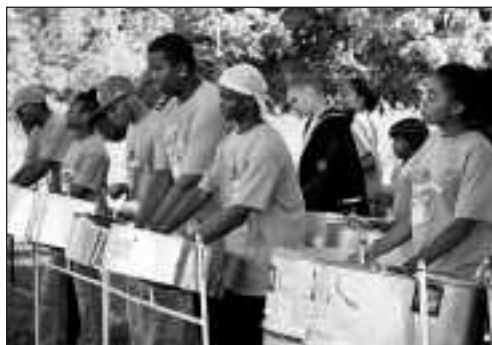
Branches Steel Band kept the music flowing all afternoon.