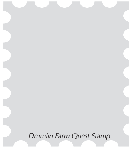
Drumlin Farm Quest Stamp

We hope this quest brings lots of pleasure, so let's get going to find the treasure!