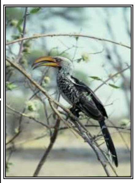
Feb. 9 -25, 2010 With Chris Leahy

Uganda is a country of startling contrasts. No other African country can match its astonishing variety of habitats including savanna, vast wetlands, arid semi-deserts, montane and lowland rainforests, volcanoes and an afro-alpine zone. Uganda's bird life is remarkable, with birds found in both East and West Africa. A highlight is the chance to see the Shoebill — among Africa's great rarities. Uganda boasts a national bird list of over 1008 species!