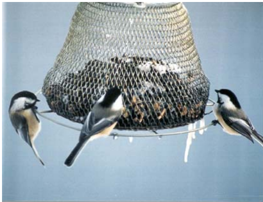
Winning Photograph: Black-capped Chickadee, submitted by Christine Galisa