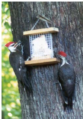
Most Unusual Wildlife / Interesting Behavior: Two Pileated Woodpeckers at suet feeder, submitted by Jocelyn Simpson