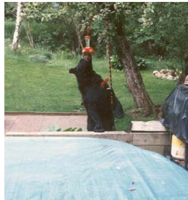
Most Humorous Wildlife: Black Bear at feeder, submitted by Sue Purdy