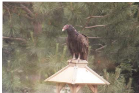
Most Unusual Bird: Turkey Vulture on birdhouse, submitted by Deborah Prato