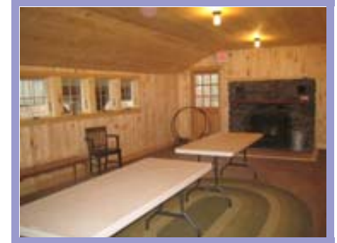
The Pond House is heated and supplied with rectangular tables and folding chairs for your party needs.

If you are interested in having a group come to the farm for a program only , and not have indoor space for snacks, this is an option, but only on weekdays. Prices may vary. Please contact our Education Department directly at 781-259-2220.